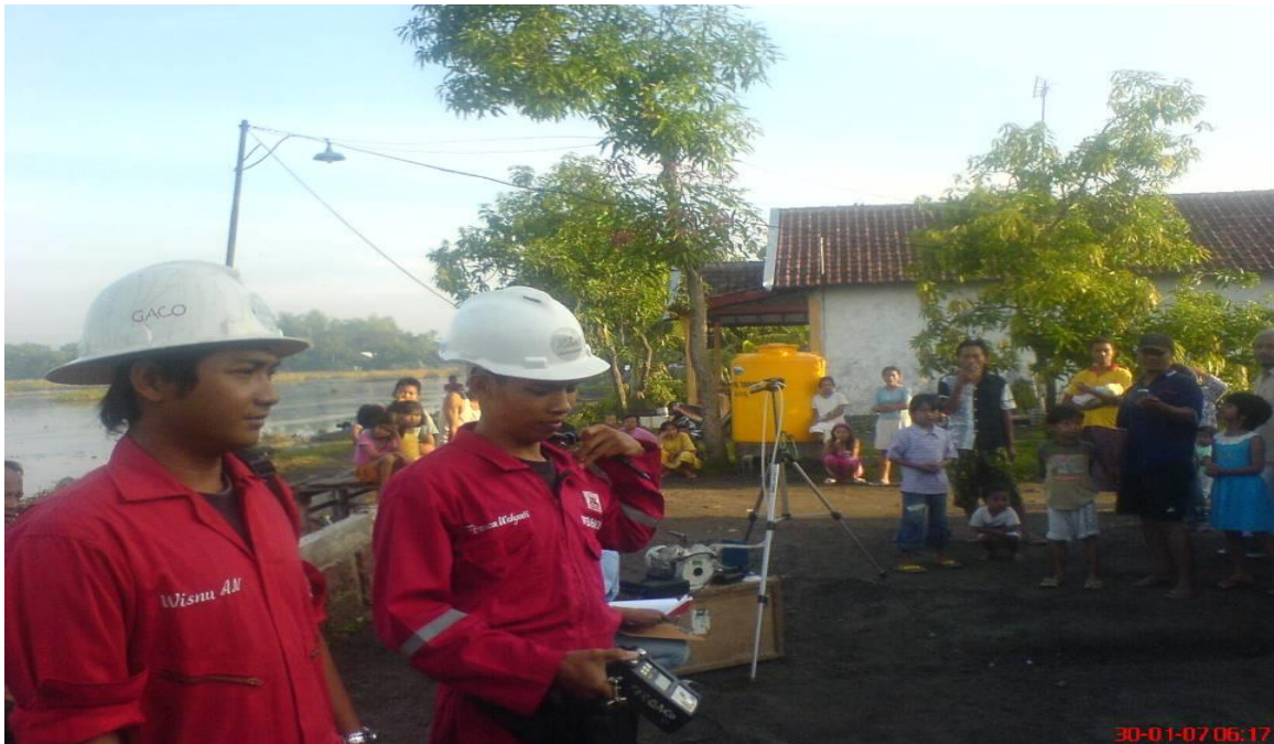
Monitoring hazardous gases (H 2 S and hydrocarbon)