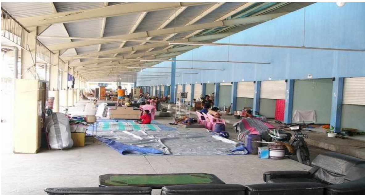
Emergency Shelter - Pasar Baru Porong